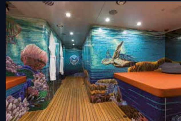
ENZO ENEA INTEGRATED ENGELBERG'S INTERIORS WITH THE SEA, WEAVING A STORY THROUGH THE DIFFERENT DECKS. FROM THE BEACH CLUB'S FUN HOMAGE TO THE WORLD BELOW THE SURFACE (ABOVE) TO THE FRESH AIRY SHORE OF THE MAIN DECK (LEFT).

"THIS IS A BUSINESS BOAT AND THERE ARE A LOT OF PLACES WHERE THE OWNER CAN WORK, BUT IT'S ALSO ABOUT ENJOYING LIFE, HAVING FUN."