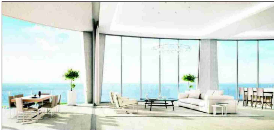
The elegant residences at Park Grove offer a serene retreat in the vibrant center of Miami with panoramic views from every angle.

For more information on Park Grove, call 305-744-5784 or visit park-grove.com .