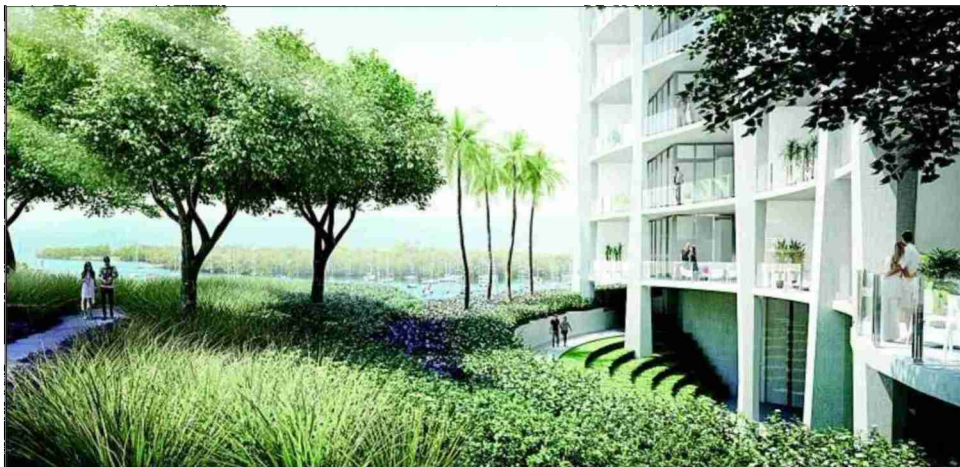
Park Grove is a cosmopolitan retreat with art-filled gardens and thoughtfully conceived outdoor living areas.

For more information and to experience the breathtaking views, visit the sales gallery at 2701 South Bayshore Drive, 7th floor, Coconut Grove. Click on www.park-grove.com or call 305-834-7600. Exclusive sales are by Douglas Elliman Development Marketing. Brokers are welcome.